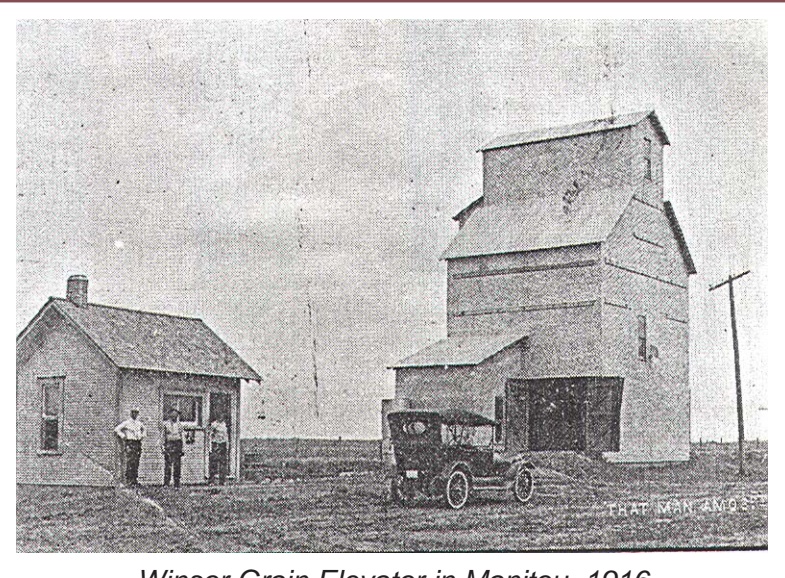
Winsor Grain Elevator in Manitou, 1916

make to keep pace with the progress that the city was making, forced him to add to his business, until today it is estimated in value at about $25,000, which is a growth in