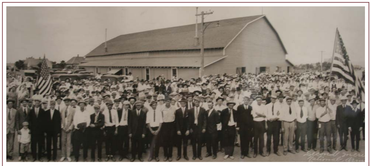
Tillman County sending young men off to training for World War I (Community Auditorium, background).