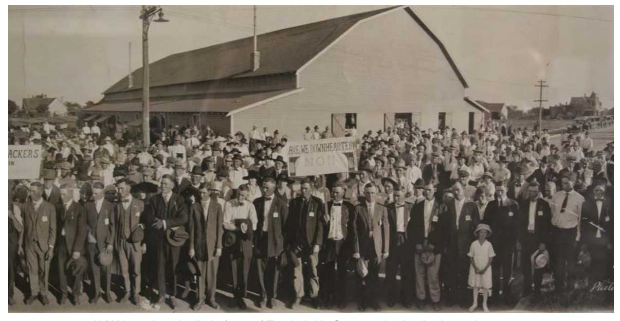
WW I war bond rally in front of Frederick's Community Auditorium, circa 1917